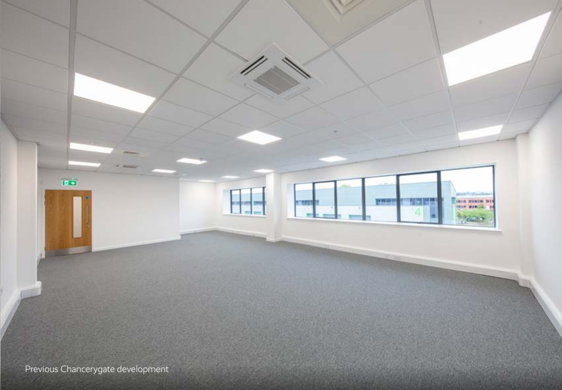
Previous Chancerygate development